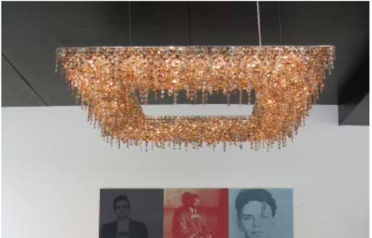
in the picture Ugolino system square 150